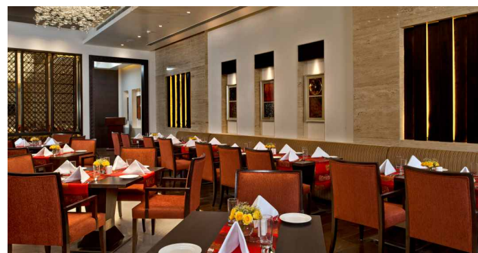
Rainbow - A specialty restaurant